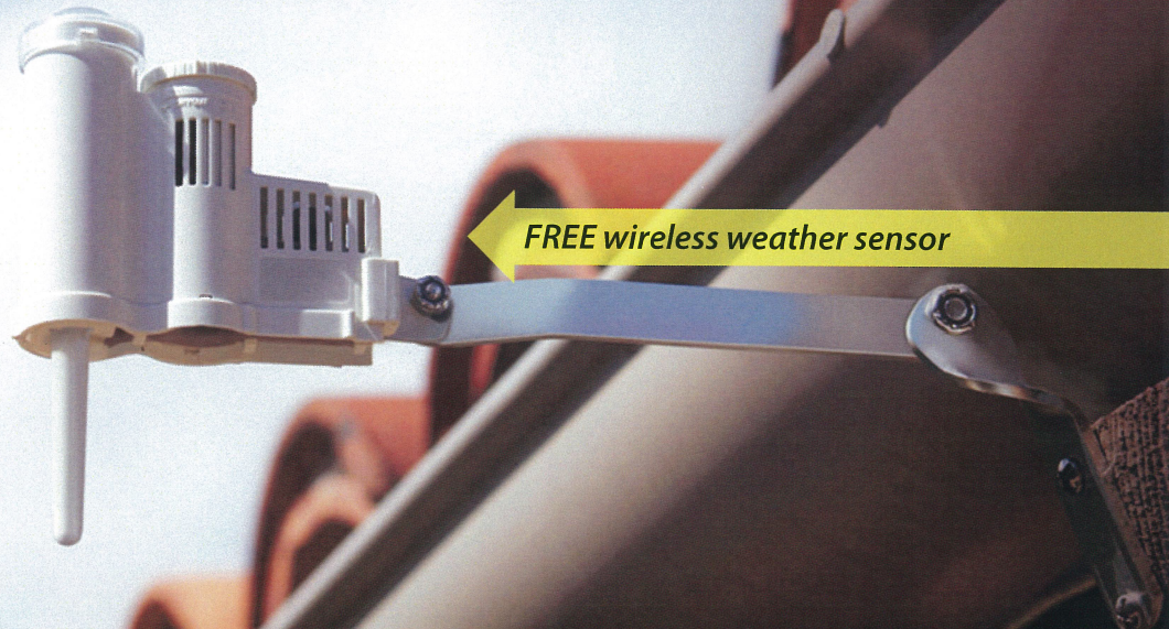
FREE wireless weather sensor