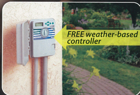
FREE weather-based controller