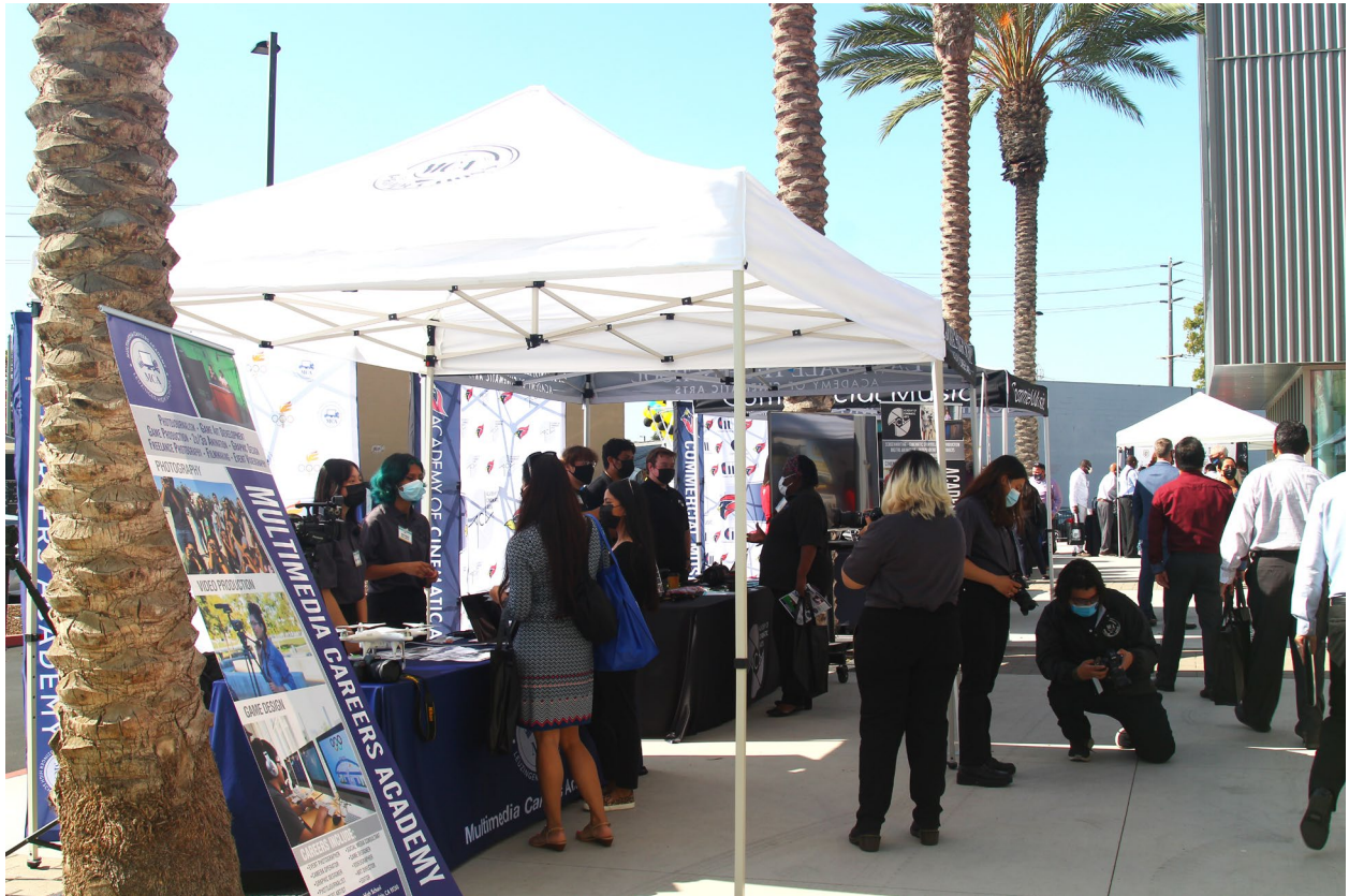
Photo caption - South Bay Workforce Investment Board partners with Centinela Valley Union High School District to present their 5th Annual Community Partner Breakfast and Academy Expo at Lawndale High School.