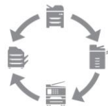
Managed Print Services