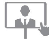
Pro AV/Collaboration Displays