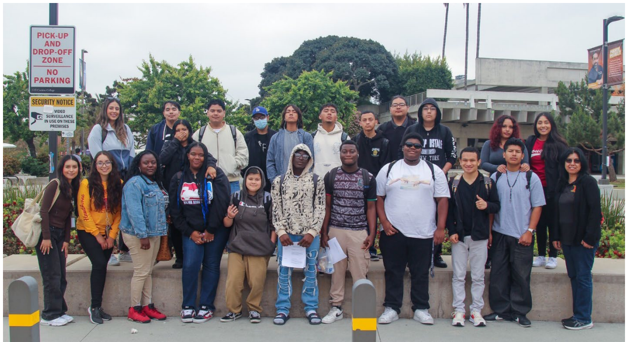
Hawthorne High school students at South Bay Workforce Investment Board's 25 th Annual Blueprint for Workplace Success Youth & Young Adult Job Fair at El Camino College.