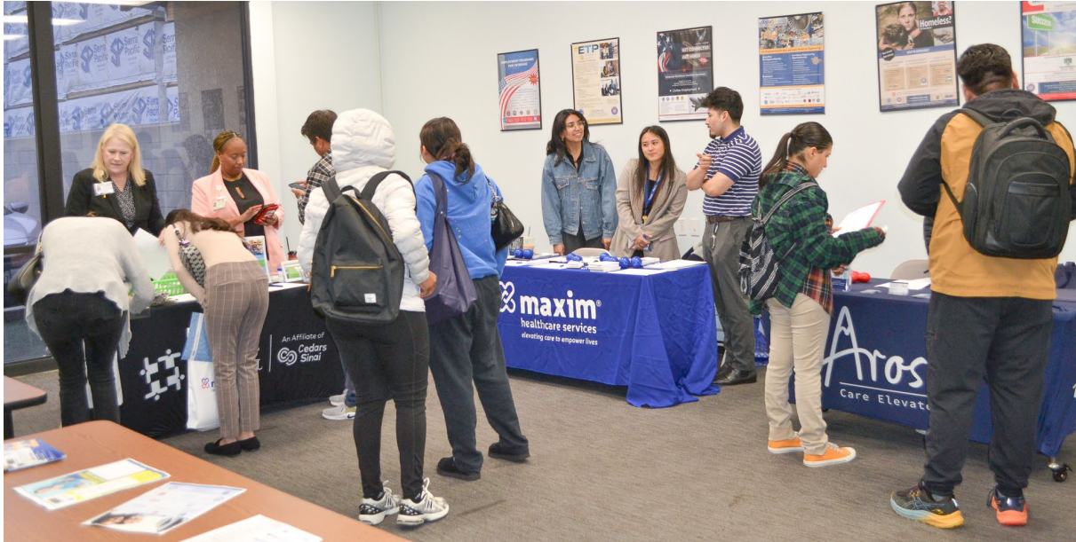
Photo caption: The South Bay Workforce Investment Board partnered with City of Gardena to present an annual hiring event at the Nakaoka Community Center that attracted more than 630 job seekers.