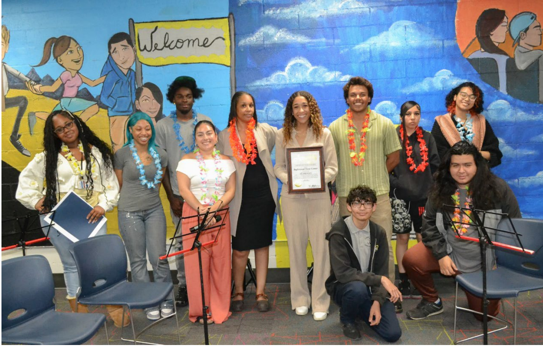
Photo caption: SBWIB celebrates 12th anniversary of Inglewood Teen Center with Aloha-themed event and announces temporary relocation.