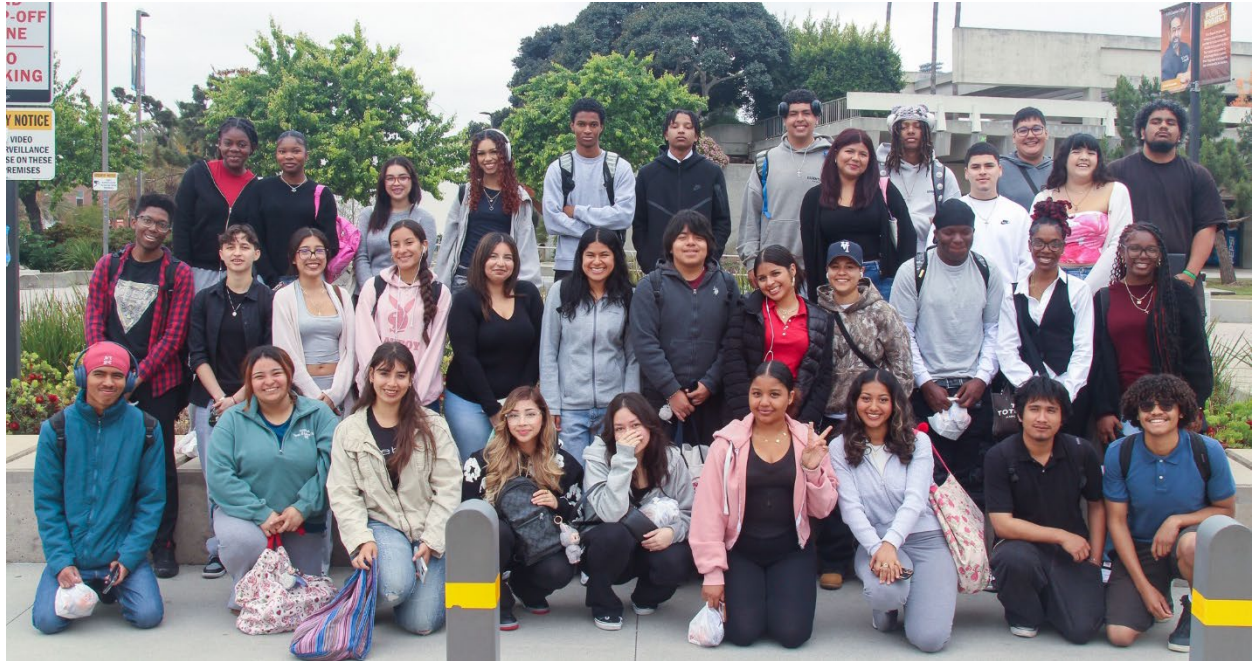
Lawndale High school students at South Bay Workforce Investment Board's 25 th Annual Blueprint for Workplace Success Youth & Young Adult Job Fair at El Camino College.