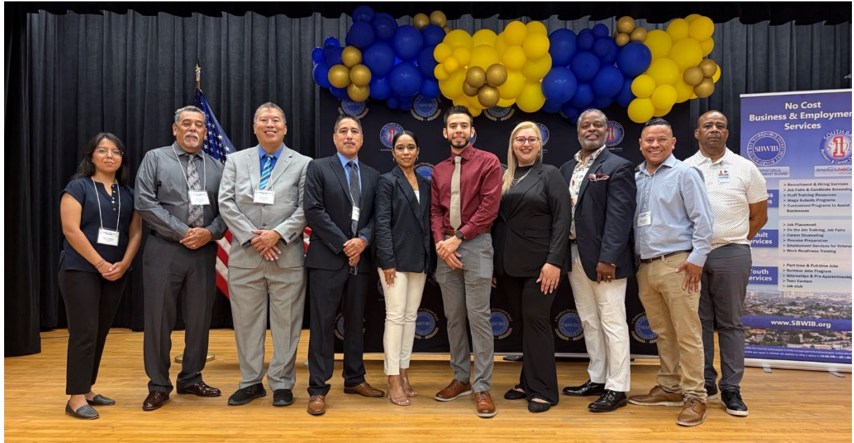
Photo caption: Over 900 Job Seekers Attend 5th Annual “Connect to Your Future” Hiring Event