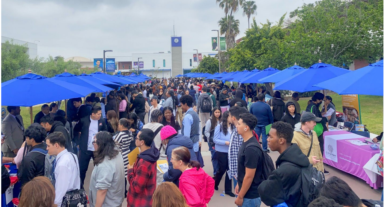
Photo caption: Over 1,400 high school and college-age students gathered at El Camino College for the 25th Annual Blueprint for Workplace Success Youth & Young Adult Job Fair presented by the South Bay Workforce Investment Board on Wednesday, April 30 th , 2025.