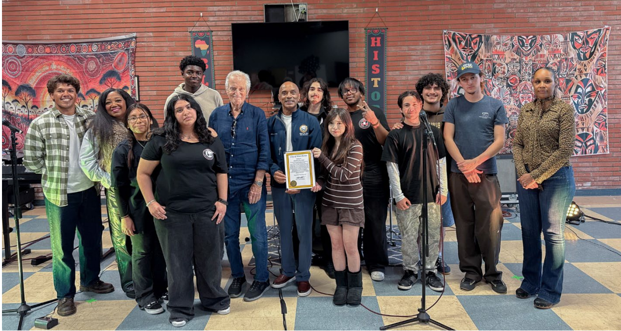
Photo caption: Students from the Hawthorne Teen Center stand alongside City of Hawthorne Mayor Pro Tem, Alex Monteiro, as the City of Hawthorne presents a Certificate of Recognition honoring the Teen Center's dedication to celebrating Black History Month and promoting education, leadership, and appreciation of African American history and culture within the community.