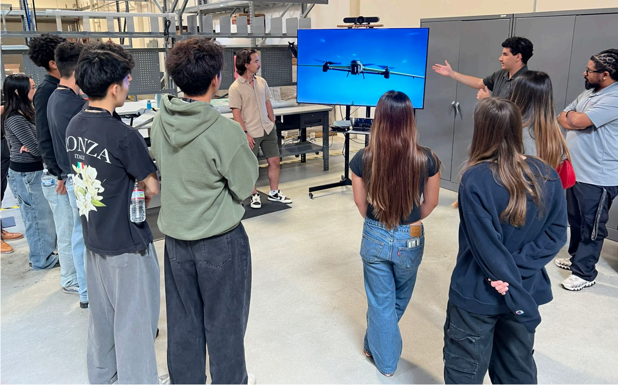
Photo caption: Thirty-two Aero-Flex Pre-Apprentices from South and Torrance High Schools explore the future of aerospace during an immersive, hands-on visit to FlightWave Aerospace field trip, facilitated by South Bay Workforce Investment Board.